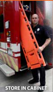
STORE IN CABINET